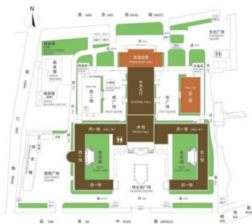
展览中心平面图 Layout of the Exhibition