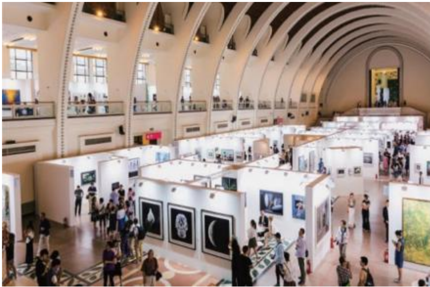
中央大厅及西侧平台层 Central Hall and West Platform Floor